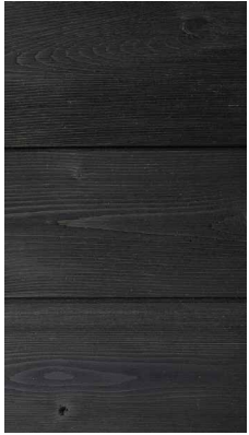
Shou Sugi Ban