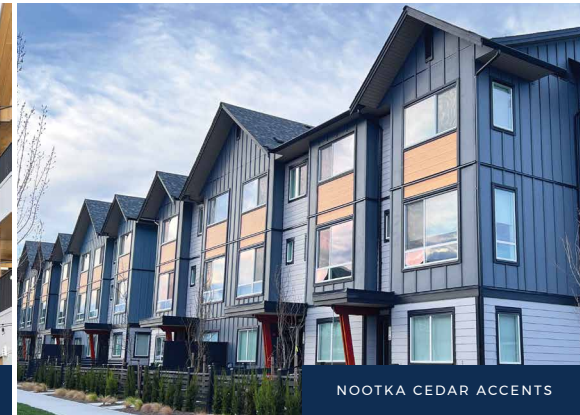
NOOTKA CEDAR ACCENTS