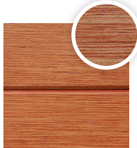
Western Red Cedar

*AdSeal 1940 Hybrid 194-14 *Quad Max #224 - 2149694