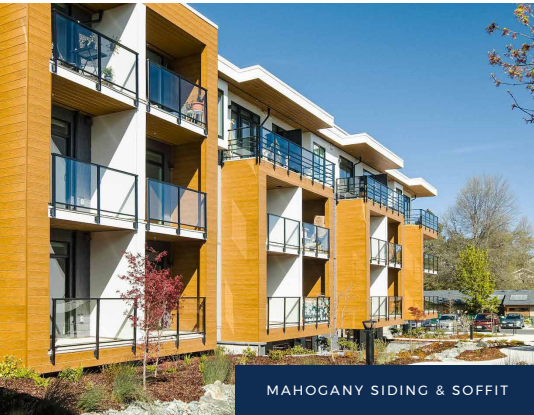
MAHOGANY SIDING & SOFFIT

Ideal pest-resistant alternative to wood