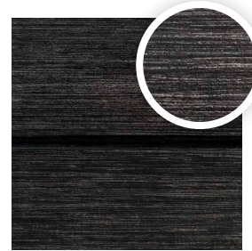
Nevada Black Rock

*AdSeal 1940 Hybrid #194-22 *Quad Max #567 - 205459