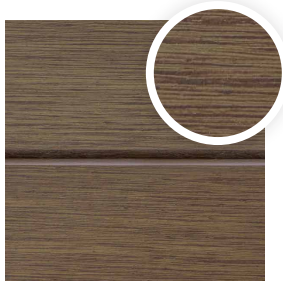
Coast Valley Walnut

*AdSeal 1940 Hybrid 194-32 *Quad Max #288 - 1869836