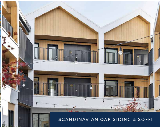
SCANDINAVIAN OAK SIDING & SOFFIT